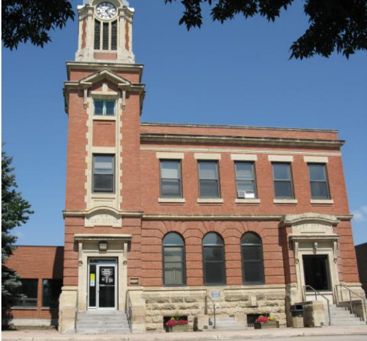
Boyne Regional Library in Carman