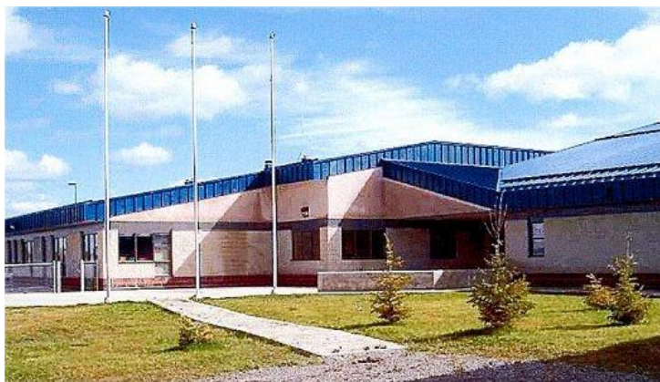
Pukatawagan Library is located in Saskatew School.