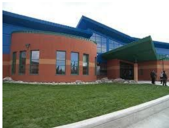
Chemawawin Public Library is located in Chemawawin School in Easterville.

"Public libraries can become the living, breathing heart of a community. It draws in people from all ages, to all interests. It opens up the world in a comfortable, safe environment for everyone. It is more than just books, but a thriving community centre for activities, events, as well as a place for study and contemplation."