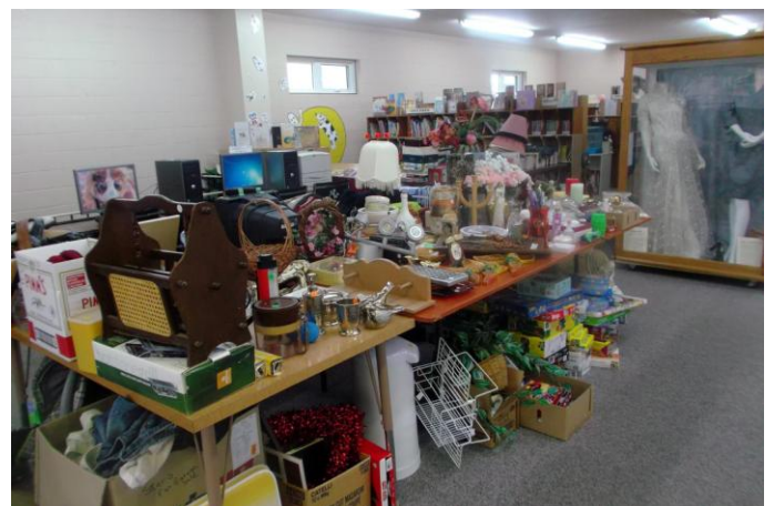
Garage Sale goodies filled the library.