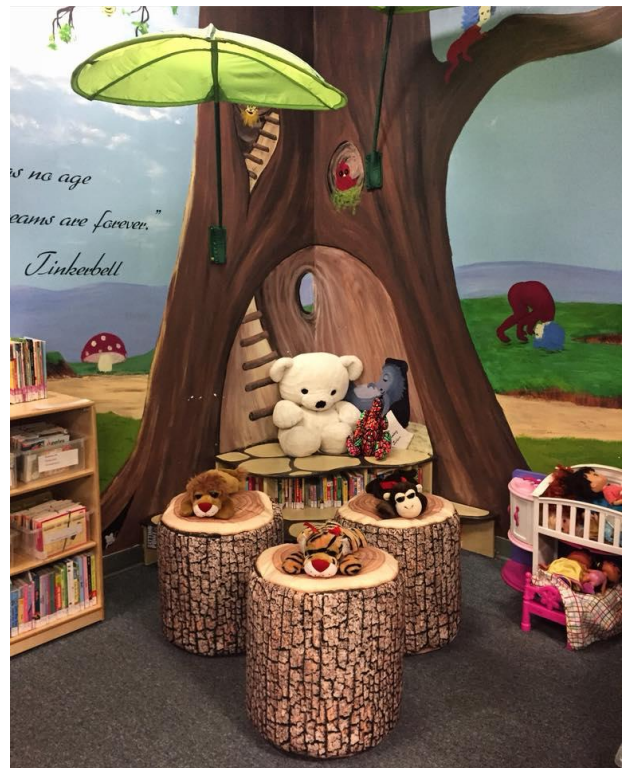
The stumps are a new seating option for adults in the Children's section of Flin Flon Public Library.