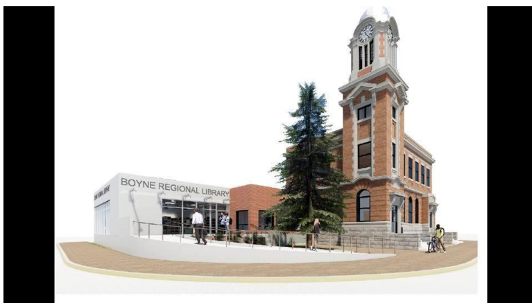
The proposed new look to the Boyne Regional Library in Carman. Fundraising continues.