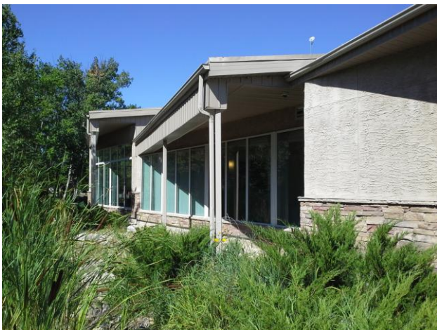
Bibliothèque Allard Library along Hwy 11 in St-Georges, MB, south of Pine Falls.